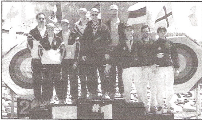
Olympic Team Champions Bohica (C), 2nd-Belgium (L), 3rd-Turkey (R)