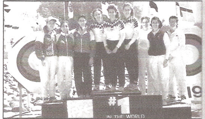
Olympic Team Champions Not Dumb Blondes (C), 2nd-Turkey (L), 3rd-CRA's (R)