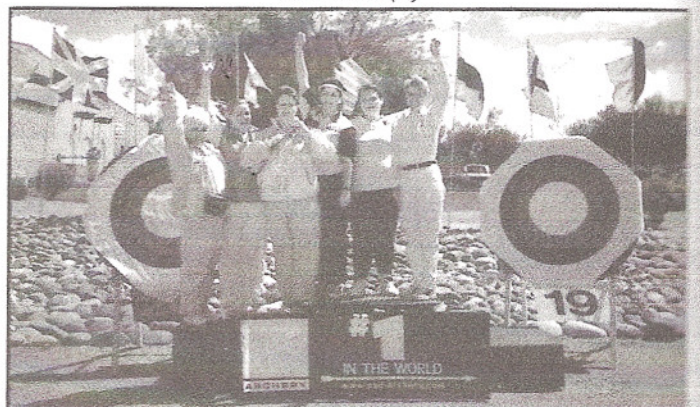
Compound Champions DAT Team (R), 2nd-Canada (L)