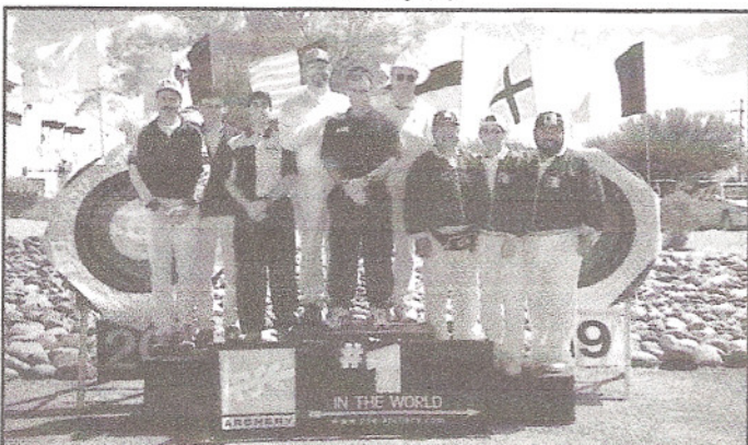
Compound Team Champions USA#1 (C), 2nd-PRK (L), 3rd-Mex-Com (R)